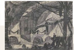
GIAMBATTISTA PIRANESI Carceri d'invenzione 1745/50