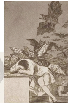
FRANCISCO GOYA Los Caprichos 1797/98