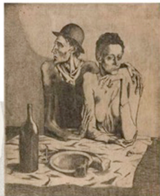
PABLO PICASSO Suite des Saltimbanques 1913