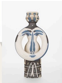
PABLO PICASSO Ceramics 1948—1971