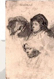
REMBRANDT VAN RIJN Three heads of women, one asleep 1637