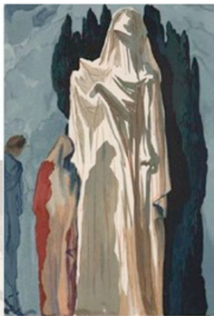
SALVADOR DALÍ Divina Commedia 1960