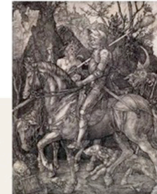
ALBRECHT DÜRER Knight, Death and the Devil 1513