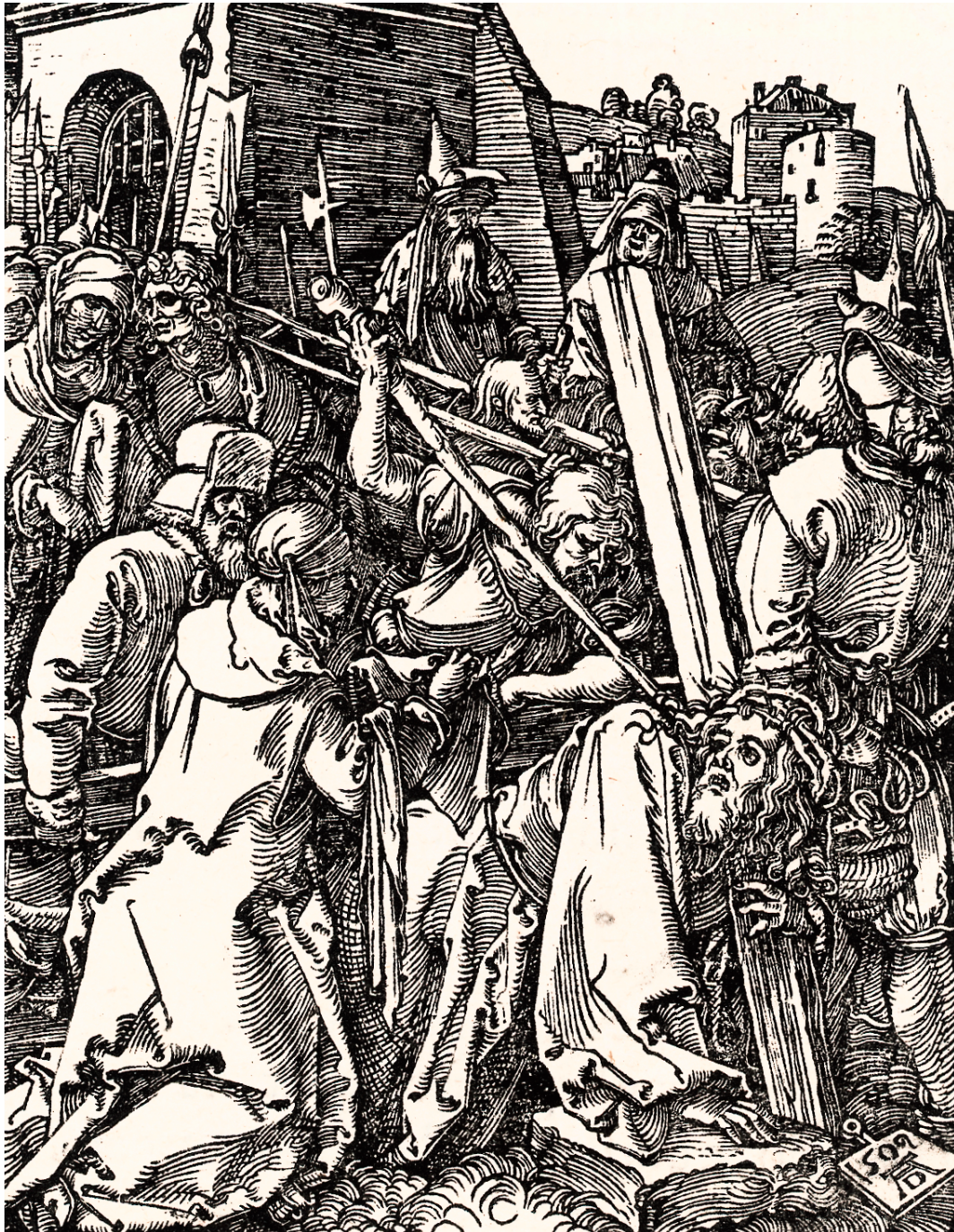
SMALL WOODCUT PASSION (1509-1511)