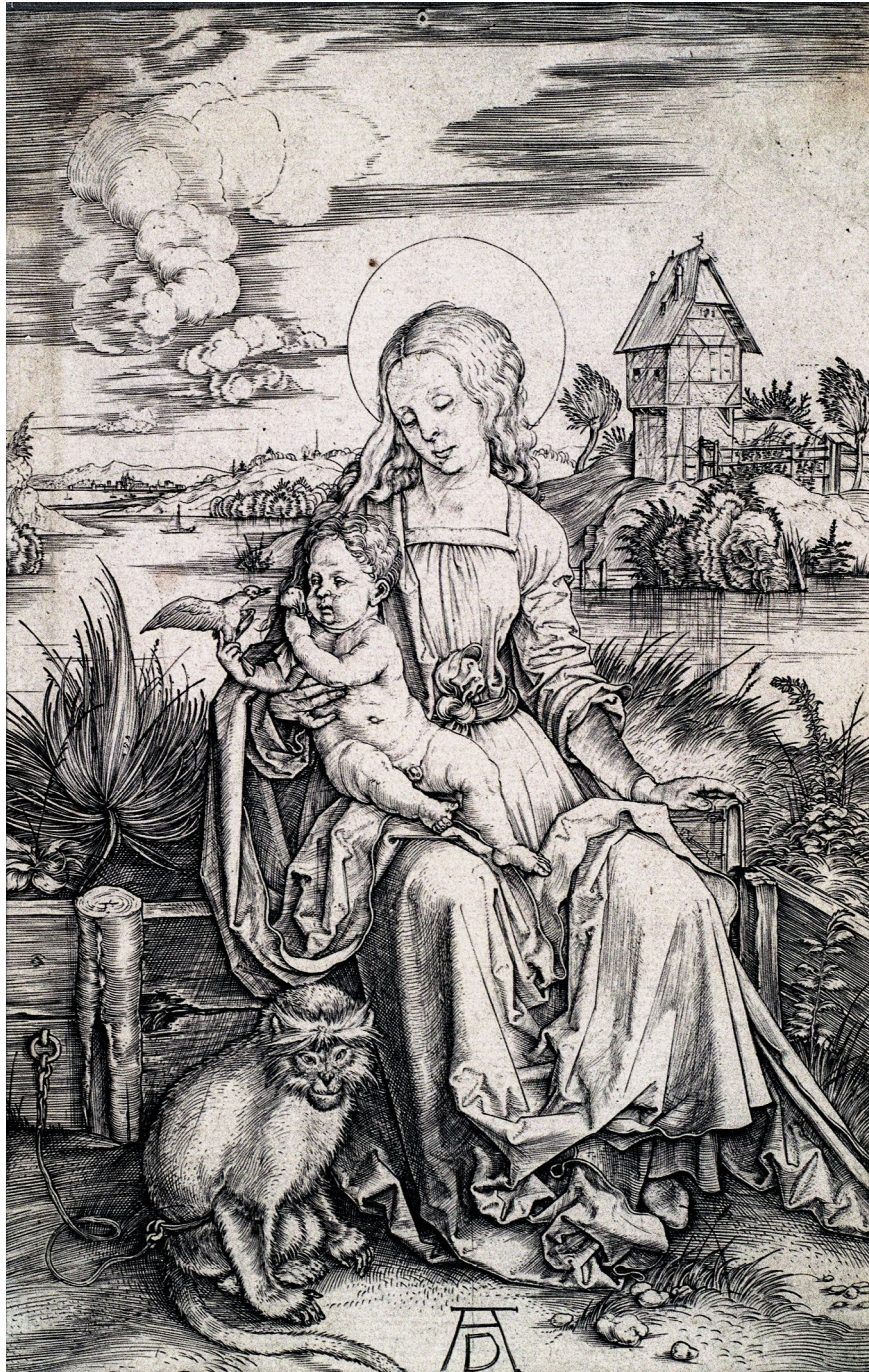
THE VIRGIN AND CHILD WITH A MONKEY (1498)