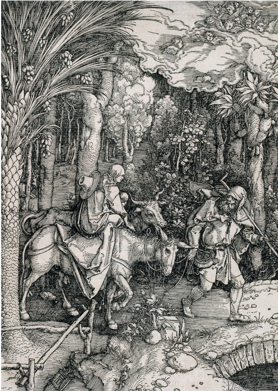
LIFE OF THE VIRGIN (1502-1511)