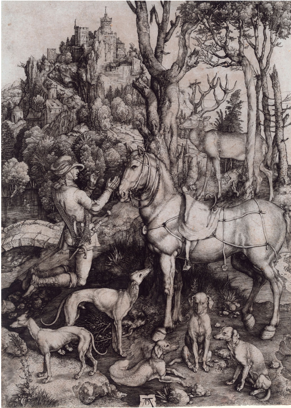
SAINTE EUSTACHE (1500-1501)