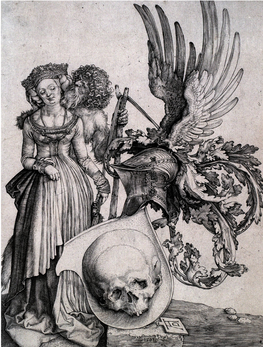
COAT OF ARMS WITH A SKULL (1503)