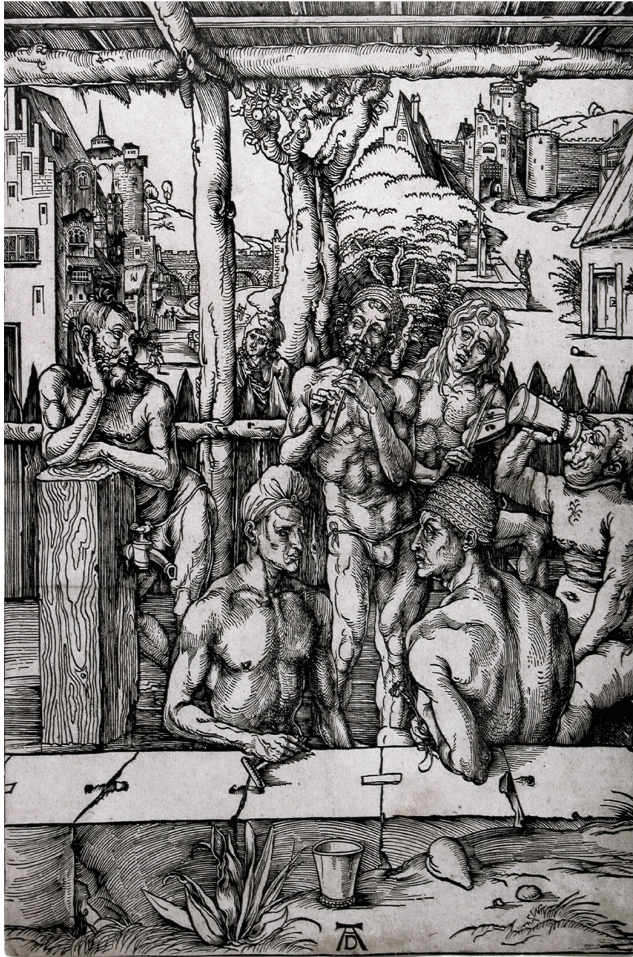
THE MAN'S BATH (1496)