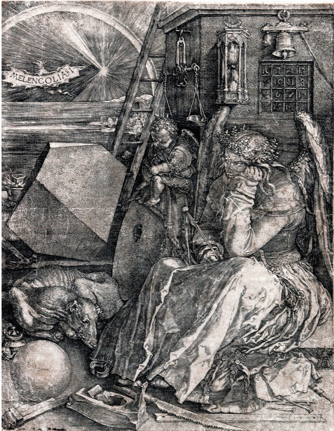
MELANCOLIA I (1514)