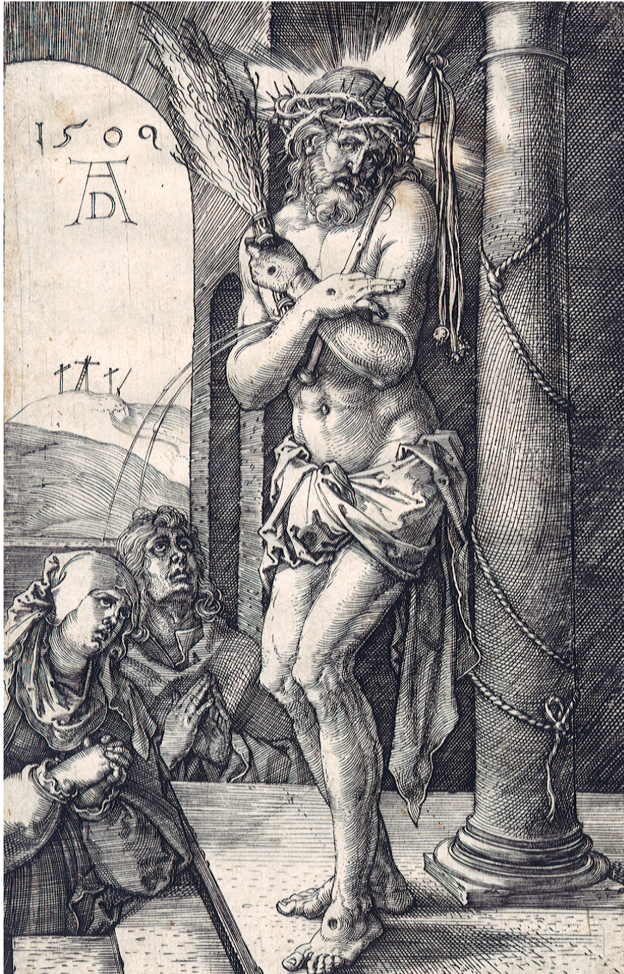
ENGRAVED PASSION (1507-1513)